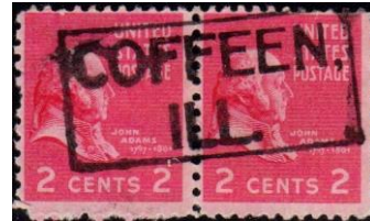
2.467 hi bar EF