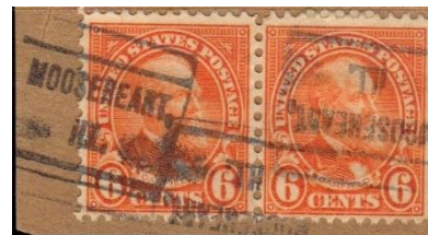
0.4613 all edges of dev inked