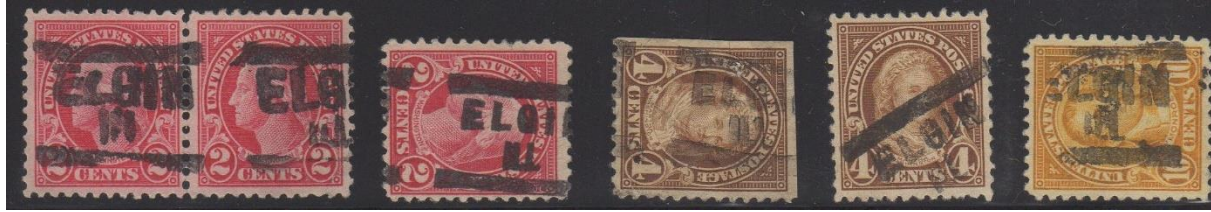
ELGIN 0.46(53/13)2 MS HS with bars