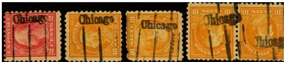
0.2243 MS 3 line City HS