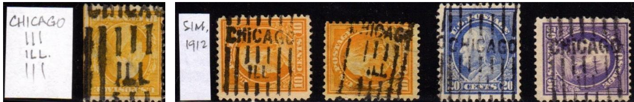
0.4644 CON 7 line