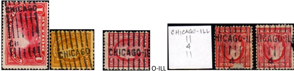
0.1643 MS 7 line City HS