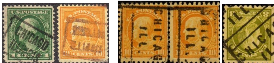
? 2.4514 and sim diff box