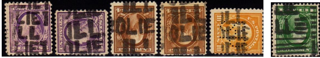
1.4646 multi-subj HS and some more examples