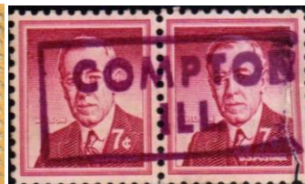
2.469454 flared M