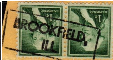
2.466454 mixed font in 1 line