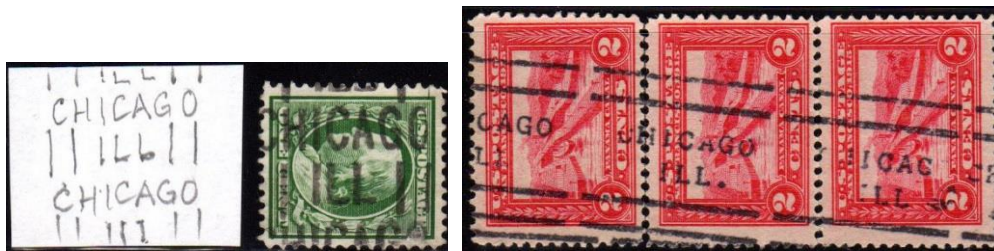
0.46 MS 4 line HS