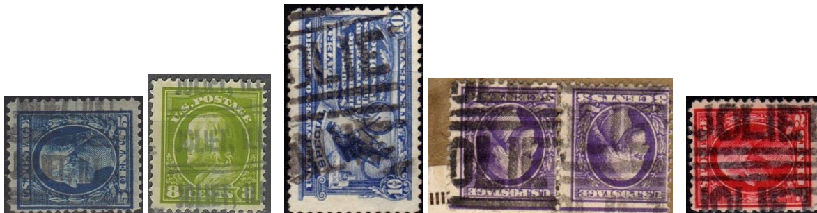
0.1613 and a clearer copy